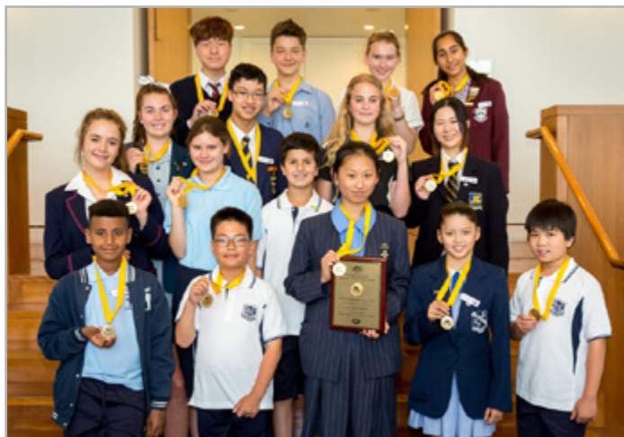
National winners at the National History Challenge awards ceremony, Parliament House Canberra